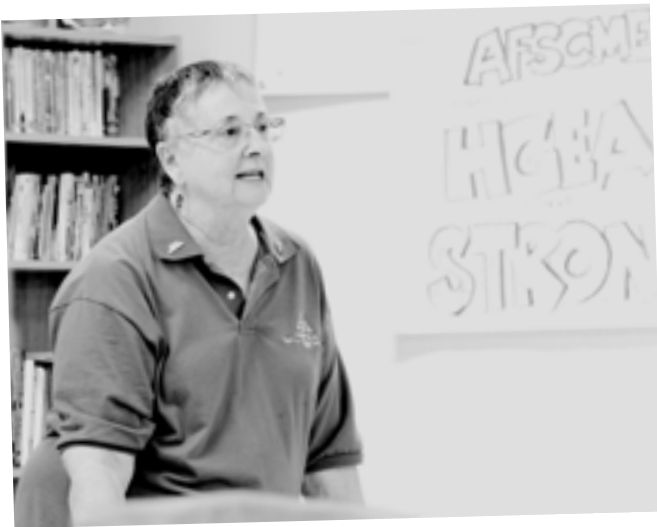
January 24, 2017 HGEA Office